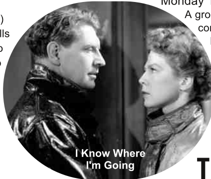
I Know Where I'm Going

A group of nuns open a makeshift convent in the foothills of the Himalayas, but soon find their vows challenged in this exotic environment. Deborah Kerr's Sister Clodagh has a spiritual crisis, while a fellow nun becomes erotically obsessed with a British agent, leading to an unforgettable ending.