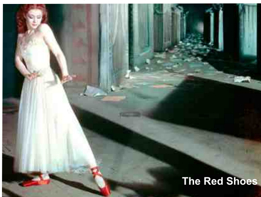
The Red Shoes

The Red Shoes marks its 30th anniversary this year), Matthew Bourne to Margaret Atwood, Joanna Hogg to Bong Joon Ho, Tilda Swinton to Derek Jarman, their cultural legacy and influence continues to be felt today.