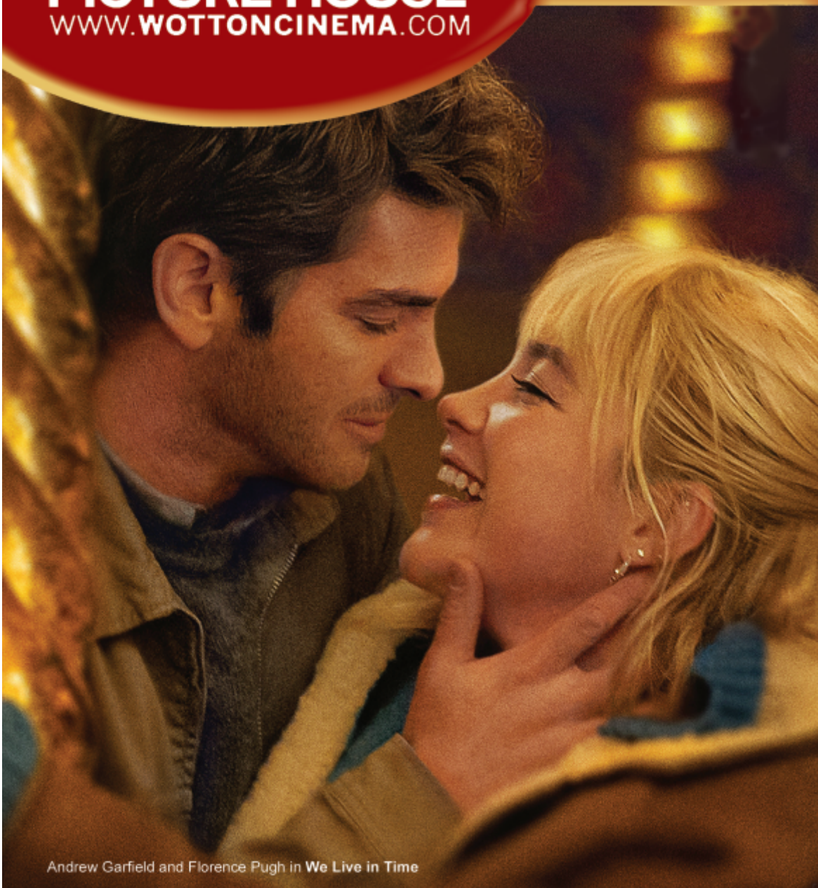
Andrew Garfield and Florence Pugh in We Live in Time

18a Market Street, Wotton-under-Edge GL12 7AE 01453 844601 www.wottoncinema.com